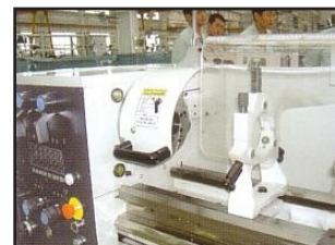
Big spindle bore

The designs and specifications are subject to modifications without prior notice.