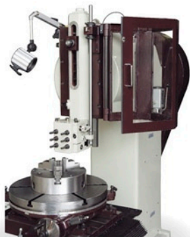
Auto Tool Backing Off Device.