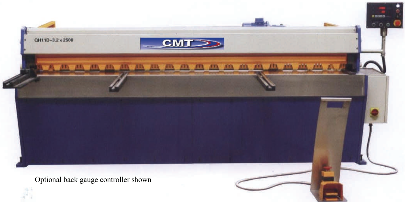
Optional back gauge controller shown